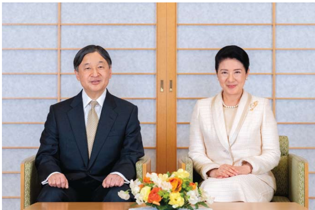
Their Majesties the Emperor and Empress of Japan.

The Government of Japan has paid close attention to the “Pentagonal Strategy Phase 1” that was launched by the new Cabinet shortly after Samdech Thipadei’s inauguration, as well as the