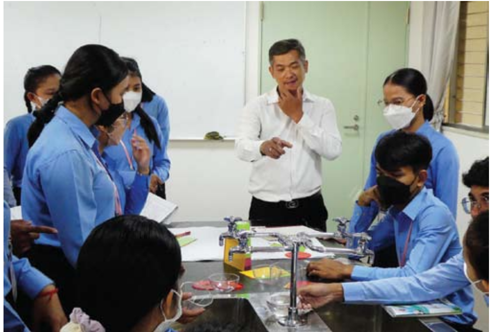
Four-year Teacher Education Colleges (TECs) produce outstanding teachers.