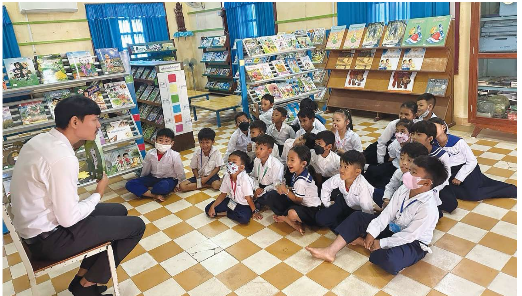
The Ministry of Education has upgraded teaching by establishing four-year TECs.

construction of buildings and the nurturing of teacher trainers, as well as the development of curriculums, syllabuses and teaching materials.