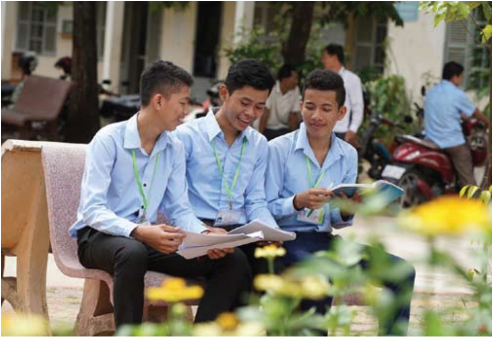
Teachers have a significant impact on the learning and lives of their students.