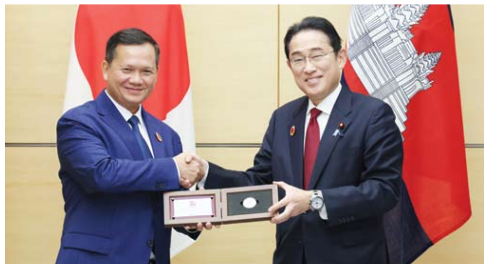
The Japan-Cambodia Summit Meeting in Tokyo last December.

Japan also continues to support Cambodia’s democratic development. From this perspective, the Government of Japan