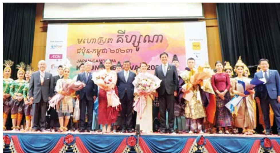
The 2023 Japan-Cambodia Kizuna Festival took place at the CJCC from February 24-26.