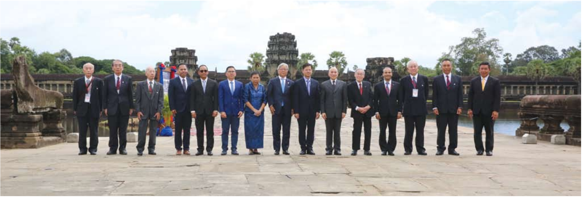
The Angkor Wat Western Causeway Construction Completion Ceremony. SOPHIA UNIVERSITY

conducted, for the sixth time, an invitation program for the young people of Cambodia who are involved in politics.