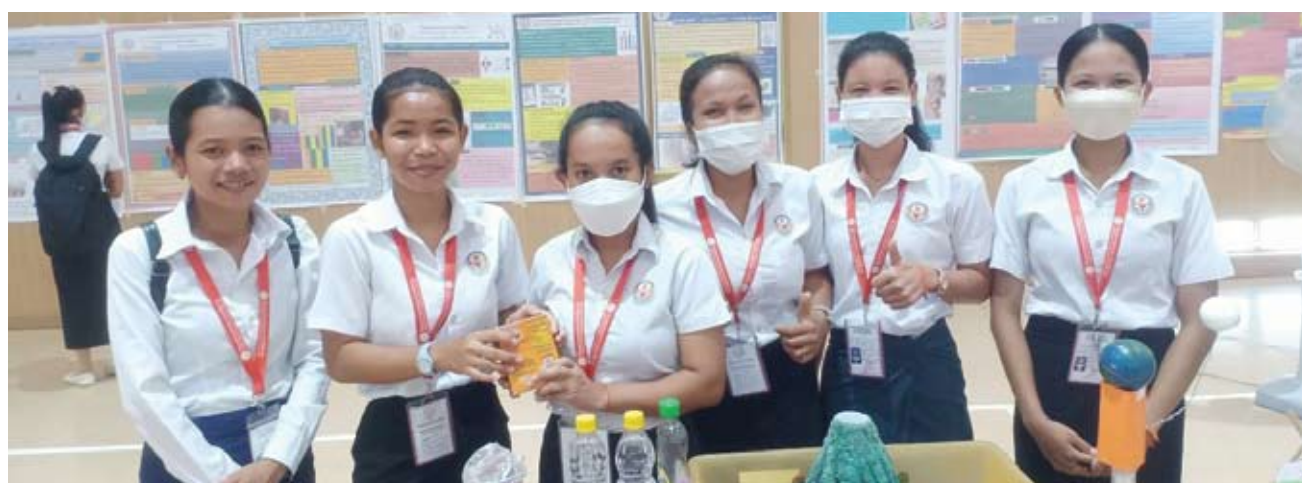
Phnom Penh Teacher Education College students.

JICA, as an implementing agency of Japanese Official Development Assistance (ODA), is to continue working with the Cambodian government, people and other development partners to contribute to the improvement of teacher education – with teachers ensuring the future of Cambodia will be bright. ●